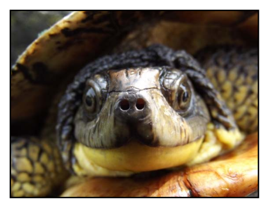
In Search of Blanding's Turtle Not easy to assess!